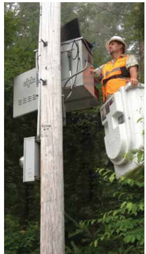
Alpha's XM360 X-Tractor software program simplifies critical data extraction, saving time and increasing accuracy.